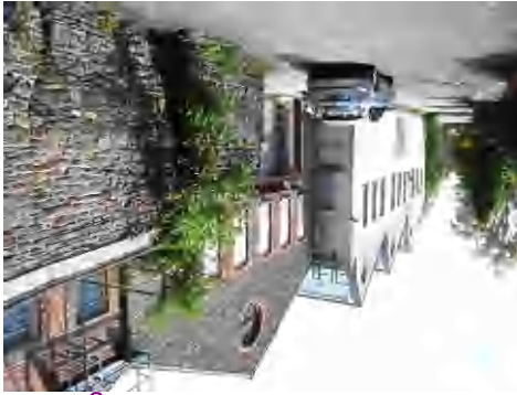
6. Key frontages – subject to detailed appraisal buildings to be retained and restored or replicated in new build to reflect industrial heritage.