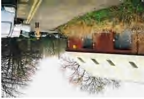
7. New active frontage in Area A – to overlook open space in area B.