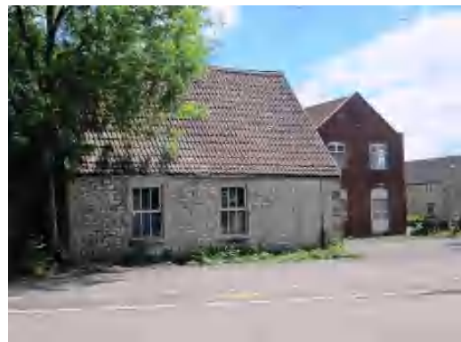
Existing buildings will need to be surveyed and considered for re-use.