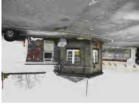
5. Gate House – to be conserved and re-used.