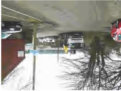
1. Main Vehicular Access – to be enhanced