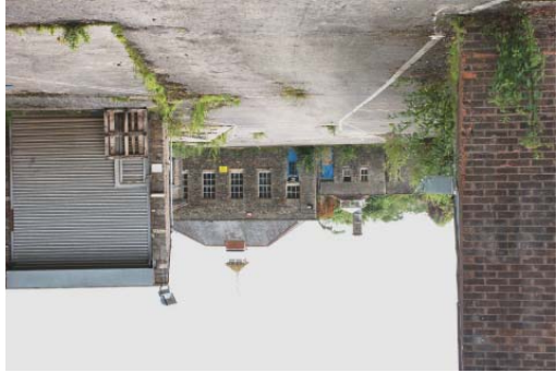
3. Canteen Building – to be restored and re-used.