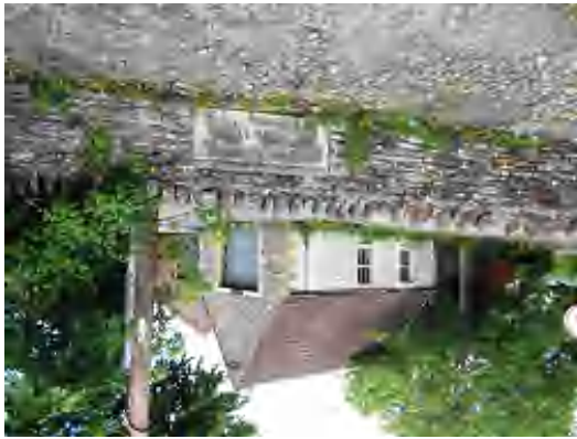
2. Former Wesleyan Chapel – Improved focal point for village