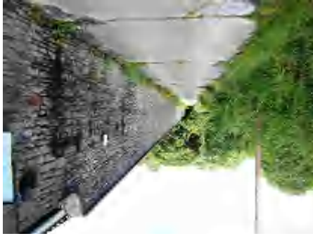
4. Mill Walls – to be conserved – possibly reduced in height