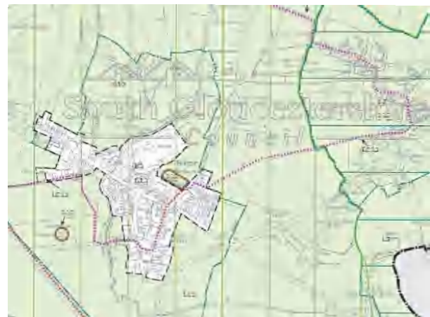
Map 1. Extract from South Gloucestershire Local Plan Proposals Map showing Bitton and Area.

Copyright © South Gloucestershire Council Licence No.100033410