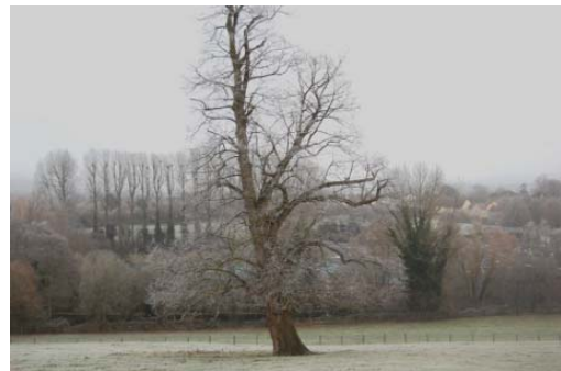
The existing site is very discrete in the wider landscape. Future impact should be minimised.