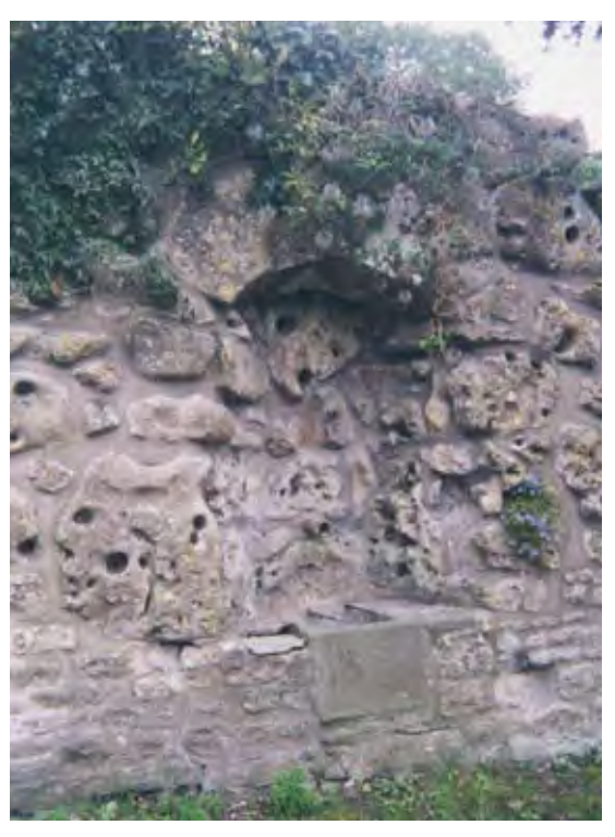
Fountain near green, Tockington

The Government also stresses the need for good design which respects local distinctiveness in Planning Policy Statement 1: Delivering Sustainable Development, including reusing and incorporating existing buildings which contribute to local distinctiveness and character of an area.