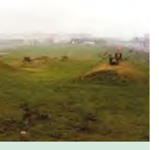
Air Raid Shelters - Filton

that new development gives careful consideration to such elements of the landscape, and that new development incorporates appropriate landscaping.