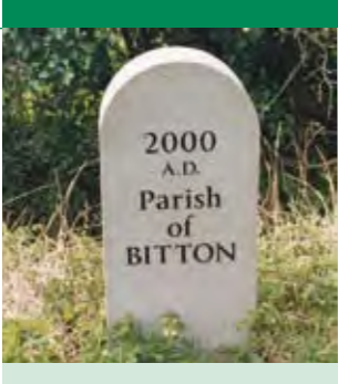
Bitton Parish Boundary Marker