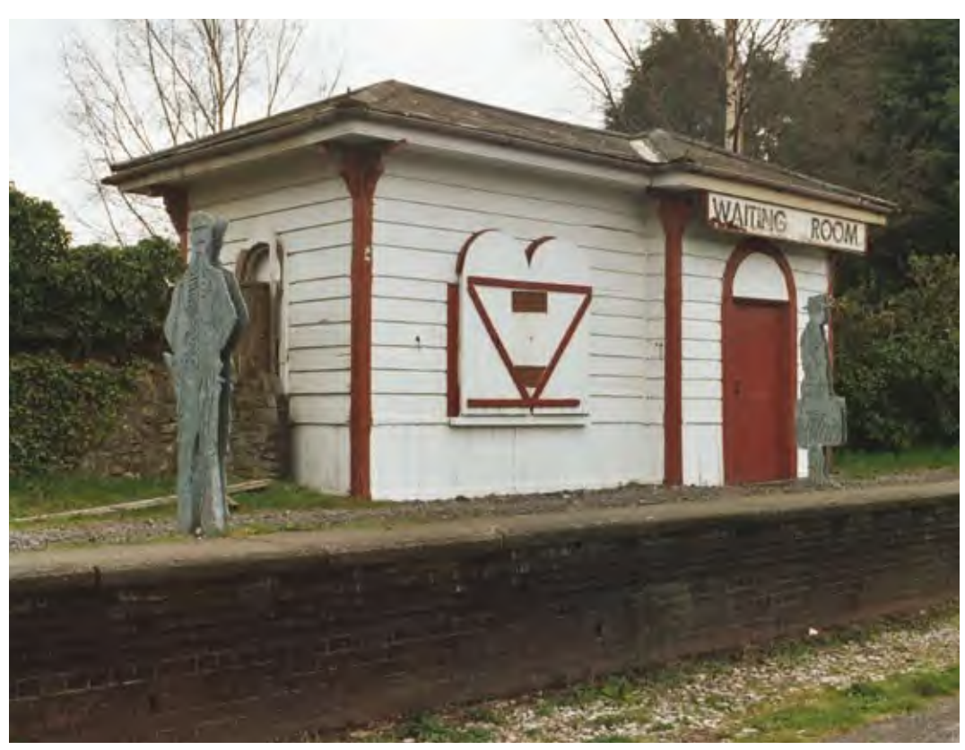
Waiting Room on the Bristol to Bath Cycle Path at Warmley

When considering proposals for development affecting buildings on the Local List, the Council will assess the proposed development using the following guidance. Where the council has no control over the alteration, extension or demolition of a building on the Local List it is hoped that this guidance will serve as a best practice guide for owners and occupiers.