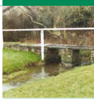
Stone footbridge -Station Road, Yate

Owners may challenge listing by demonstrating that their building or structure does not meet any of the 10 Criteria above.