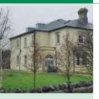
Queens Lodge - New Passage

The inclusion of a building on the Local List does not affect the planning rights relating to the building, and permitted development rights remain unchanged. However, where an application is submitted to the Council for its alteration, extension or demolition, the special interest of the building will be taken in to consideration and its Local Listing status will be a material consideration when determining the application.