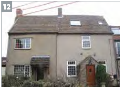
Cottage of Content - see cellar left of door

Other residents supplied factories; for example, one Henry Farmer carried baskets of coal to, and ashes from, Christy's hot water boilers.