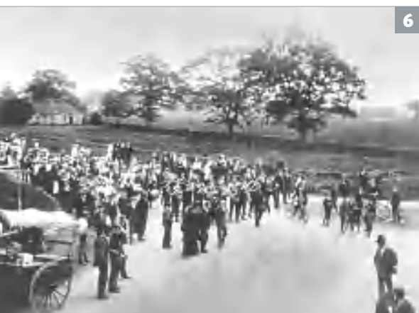
Frampton Common & Poor House from Bristol Road, 1902

You have an option here at Robel Avenue, either: