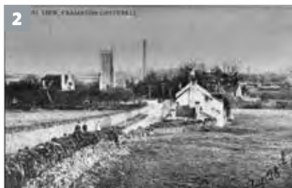
Church Road 1907