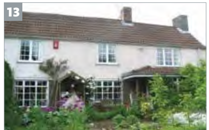
Manager's house, 8 Salem Road

Salem House and No 19 Salem Road were built in an old quarry on the site of the Dando hat factory. The family came from Dursley, and the Watley's End business was managed from 8 Salem Road opposite, built in 1779 as