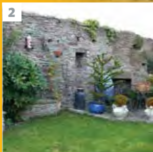
Rear walled garden with evidence of hatters' workshops