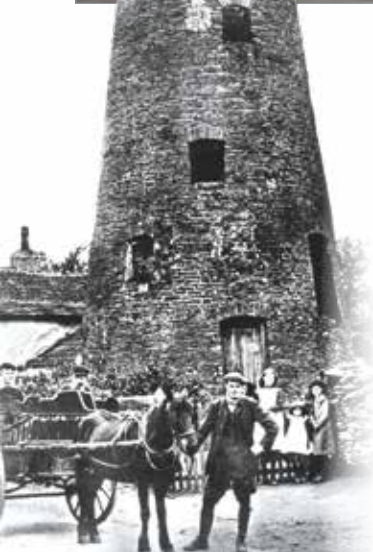
c. 1810 Windmill ground animal feed during the hatting period