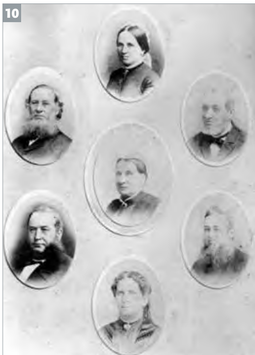
Footes Lane, on your left, is named after a hatting family who emigrated to Australia.