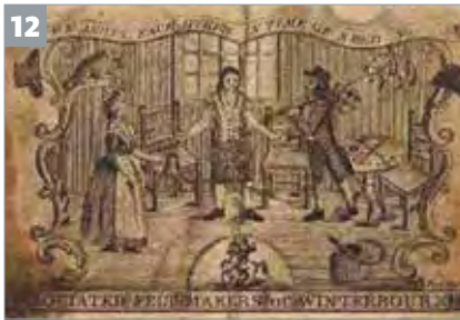
Hatter's blank for the Associated Feltmakers of Winterbourne

Reputedly built on the site of a stone quarry about 1840 and variously managed in hatting times by the Howes and Flook families, the brewery had a 'commodious taproom, spacious clubroom, bar, sitting room, two bedrooms, brewhouse, and two large barrel-vaulted cellars'. The clubroom became the hatters' turnhouse (a pub used as a local headquarters) and centre of their union administration. Local men met here to discuss pay, trade union activities, apprenticeships, and to allocate new jobs. Remarkably, Watley's End hatters, through their union, directed operations in major towns such as Bristol and Gloucester, and also in South Wales (see FCT9).