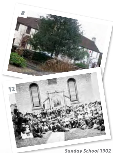
Sunday School 1902