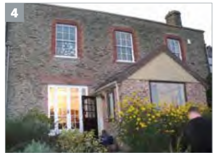
Rear of Old Factory House

This building stands out from its neighbours through its classic Georgian design; its very confidence and character indicate out-of-area money. The date stone is inscribed 1770 when it was probably a manager's house and hat warehouse with hat manufacturing in many outbuildings. Top floor cubicle rooms are correctly sized for feltmakers' bowing garrets (see Introduction figure 1); rusting hooks have been removed from ceilings. The house was owned, from at least 1827, by Rickards