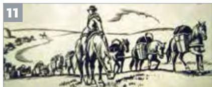
Pickford packhorse train c.1790

Made of locally quarried Pennant stone, this bridge is part of an old packhorse trail and a busy route for hatters between Frampton and Watley's End. Before 1800, goods were carried on stout draught horses, panniers either side, 20 to 30 strung together in caravans travelling many miles a day. From 1600, felt hats made locally were carried to Bristol to be shaped, styled and sold.