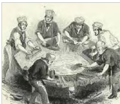
Hatters at a Felting Kettle - figure 2

In the first process a 7ft bow was twanged into the top of a pile of wool or fur to make it fly piece by piece 'like snow.' This flight caused extensive separation of the fibres. Part of the skill was to make the fibres fall in the required pattern and to the variable depth needed to make a batt hood (see figure 1).