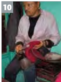
Teasel seed heads in 2nd year. Hatmaker in Tunis using teasels in 2011