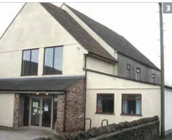
Original Zion Chapel (extended)