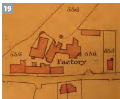
18 & 19 Hall's Factory Plan, 1841

Church Road 1908 - old bridge from Bridge Way as it would have looked in hatting times