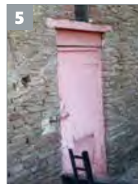
Old workroom door

Typically, from the 17th century, feltmakers made hat bodies quietly, without machines, in a small extra workroom, often with a sloping roof, behind their cottages. Such a workroom still exists at the far end of this terrace.