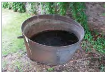
Hatter's kettle at 415 Church Road (FCT5b)

Start: either at bus stop in Church Road, near School Road junction, or Crossbow House Community Centre, School Road. Turn right into School Road and continue to end of