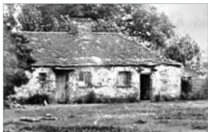
The Poor House

Continue past the former post office, (now an Accountants) to cross School Road (dropped kerbs) and then Western Avenue (lower kerbs), going a few metres further to: