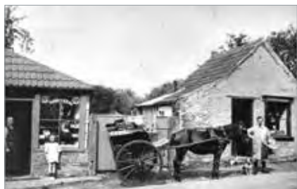
Hales: saddler & leather left; butcher, right

Turn left and cross road to pavement. Turn left into Hillside Lane to see