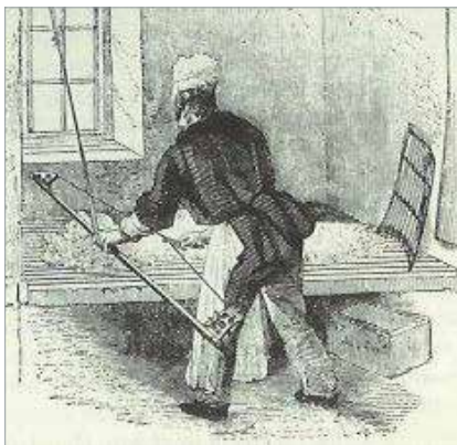
Feltmaker with bow - figure 1

There are many stages in the manufacture of a felt hat, but local hatters concentrated mainly on the early processes from fur to felt hood production. Felt is unique: unlike other fabrics it is unwoven and has no thread. It is manufactured when animal hair or wool is rolled and squeezed into an even compact mass. Feltmaking for hats was an unusual and highly skilled craft involving two operations: separating and laying the fibre into the required shape or batt; and rolling the batt under hand pressure to compact it.