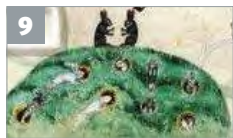
Medieval rabbit pillow mound

Village hatters made their reputation from their skill in using the lowest quality wool and fur. Better quality imported materials were kept from them by royal monopoly (Spanish merino wool) or by auctioning only in large bundles at high prices in London (beaver and other exotic furs). Rabbits were used increasingly for better finishes on hats. Warrens had been used as food for the Lord of the Manor and included pillow mounds that encouraged the rabbits to stay. When cheap tinned rabbit meat was imported from Australia, and the introduction of winter crops in the 1790s allowed rabbits to feed in the wild, many warrens closed, but some continued to supply local hatters. Cloisters Common was enclosed and sold in about 1856. The name of the area is not monastic in origin; it is thought to derive from 'Claysters', denoting high clay content in the soil.