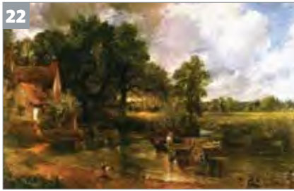
Constable's Hay Wain