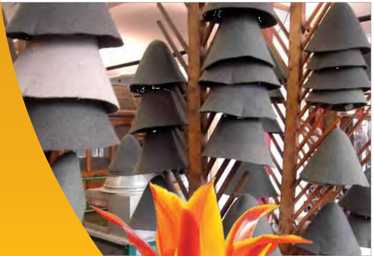
Felt hoods ready for hat-making - figure 3

Until recently it was not generally known that the parishes of Frampton Cotterell and Winterbourne were home for about 300 years to an unusual and fascinating industry – the making of felt hoods and hats from wool and animal fur. Together these two centres employed about 4,000 men over this period. The manufacture began around 1570 in a dozen villages to the east of Bristol, squeezed between the escarpments of the Cotswolds to the north and the River Avon to the south. Hat making, using only hand tools and skills learned as an apprentice, was a cottage industry serving haberdashers in Bristol who finished and then sold hats throughout the West of England, exported them across the Atlantic to the new colonies, and provided cheap hats to barter for West African slaves and to wear in the slave plantations.