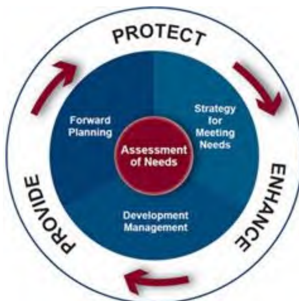
Figure 1: Sport England themes - Protect, Enhance and Provide

To provide new playing pitches where there is current or future demand to do so