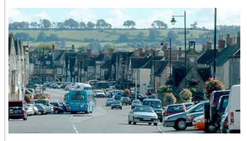
7 View along Chipping Sodbury High Street towards the Cotswold Scarp.