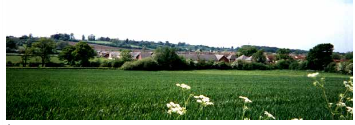
1 The southern edge of Charfield village showing the recently built housing in Woodlands Road. Wickwar Ridge can be seen on the skyline. Roof colouring in this development is more sympathetic to the area than some previous examples.