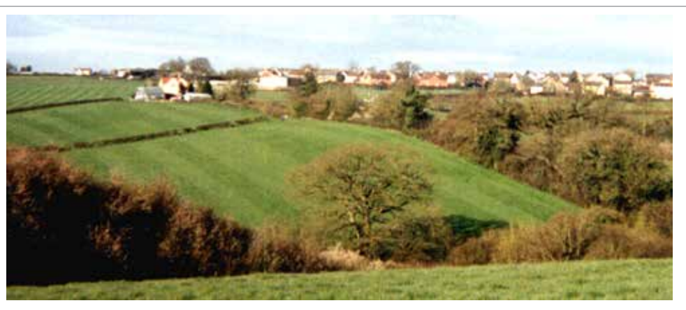
2 View of the eastern edge of Wickwar village, set above the Little Avon Valley.