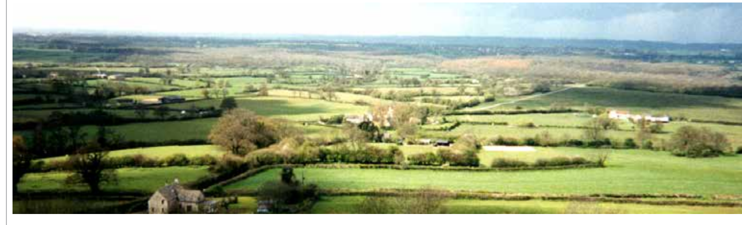
3 Wetmoor Wood in the middle distance looking towards Wales, from the scarp.