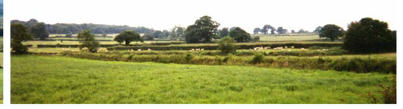
4 The vale looking towards Horton Bushes showing typical square cut hedges.