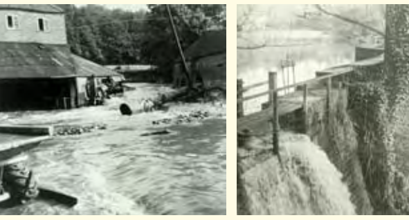
ne in front of Willsbridge Mill July 1968 after breaching of Dam wall