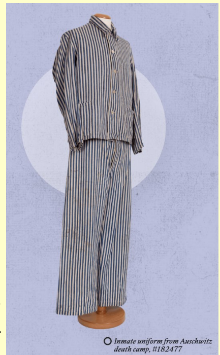
○ Inmate uniform from Auschwitz death camp, H182477

This unprecedented project has been embarked on by the Holocaust Memorial Day Trust (HMDT) – the charity established by the UK government to promote and support Holocaust Memorial Day in the UK, and The National Holocaust Centre and Museum. OOEJ - Homepage - Ordinary Objects, Extraordinary Journeys