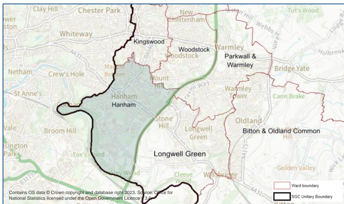
Map showing location of Hanham and neighbouring wards

To produce ward data, ONS use best-fit estimates based on combining the data from Output Areas. Best-fitting is the method used to produce estimates for any output geography using Output Areas (OA) as building blocks. These are the lowest level of geographical area for census statistics comprising a usually resident population between 100 and 625 persons and 40 to 250 households.