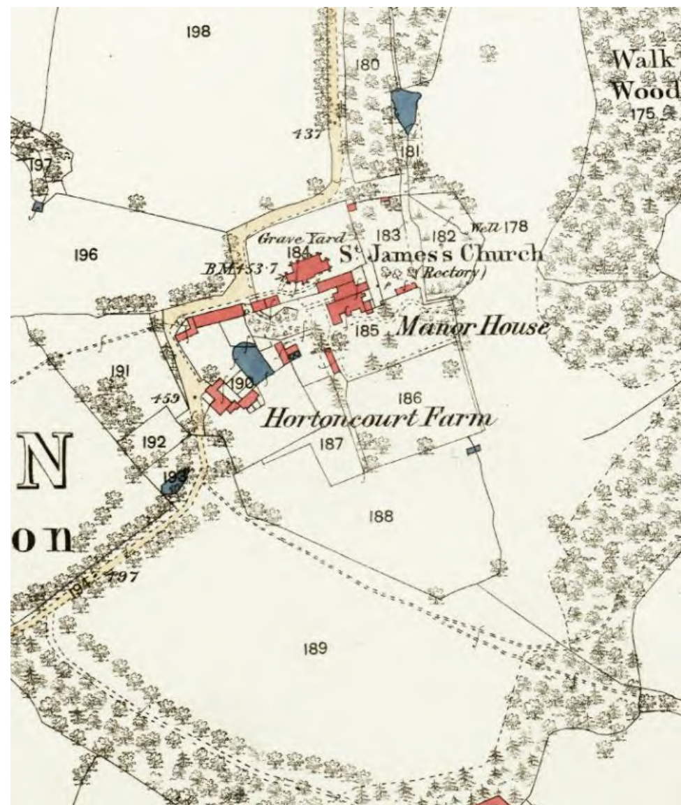
Circa 1880 Ordnance Survey map Horton