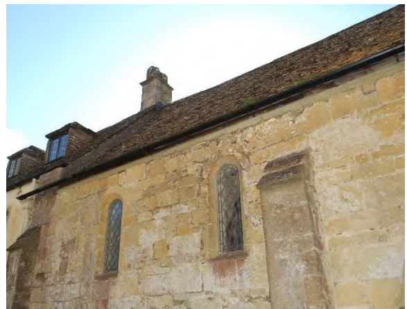
Figure 5. Left, Horton Court Figure 6. Right, Norman Hall