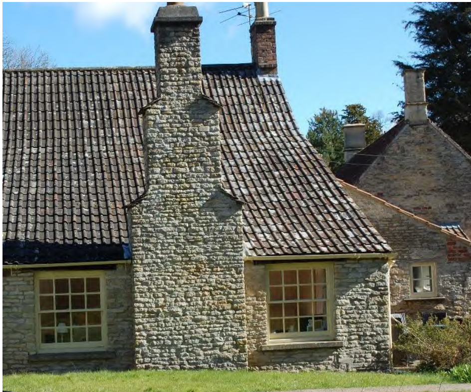
Figure 9. Horton Cottages

Horton Cottages, lying to the South West of Horton Court also date from the 16 th century and were formerly the farmhouse to the Court (See figure 9). Further afield, there is also evidence of archaeological remains of a lost part of the village, rabbit warrens, deer park, and to the north a large fairly complete set of fishponds which provided the Court with fresh fish.