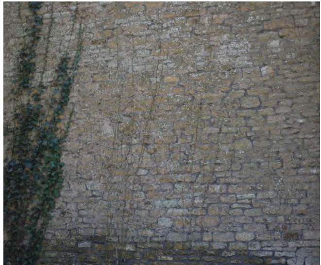
Figures 14 and 15. Examples of Cotswold stone walls in Horton