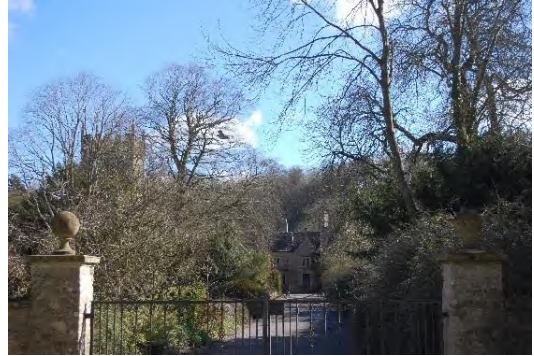
Figures 12. Left, View west from Horton Cottages. Figure 13. Right, First glimpse of Horton Court and church from Cotswold Way.