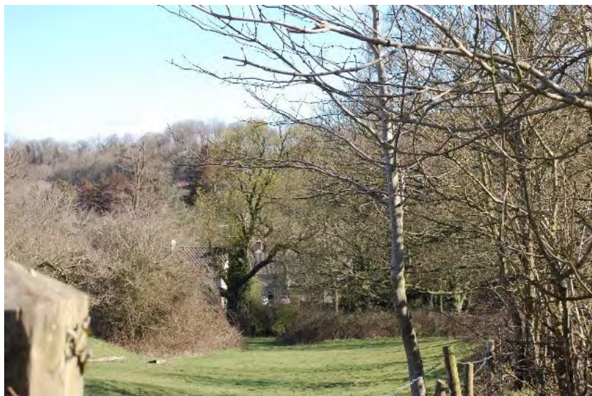
Figures 10. Left, View looking westwards from the brow of the hill on Cotswold Way. Figure 11. Right, View looking south into the village from Cotswold Way.

The narrow winding road lined with mature trees adds an element of surprise to the area, ensuring that the Church and Horton Court remain obscured from the roadside until the last minute (see figures 12 and 13). The small number of buildings that make up the settlement create its unique