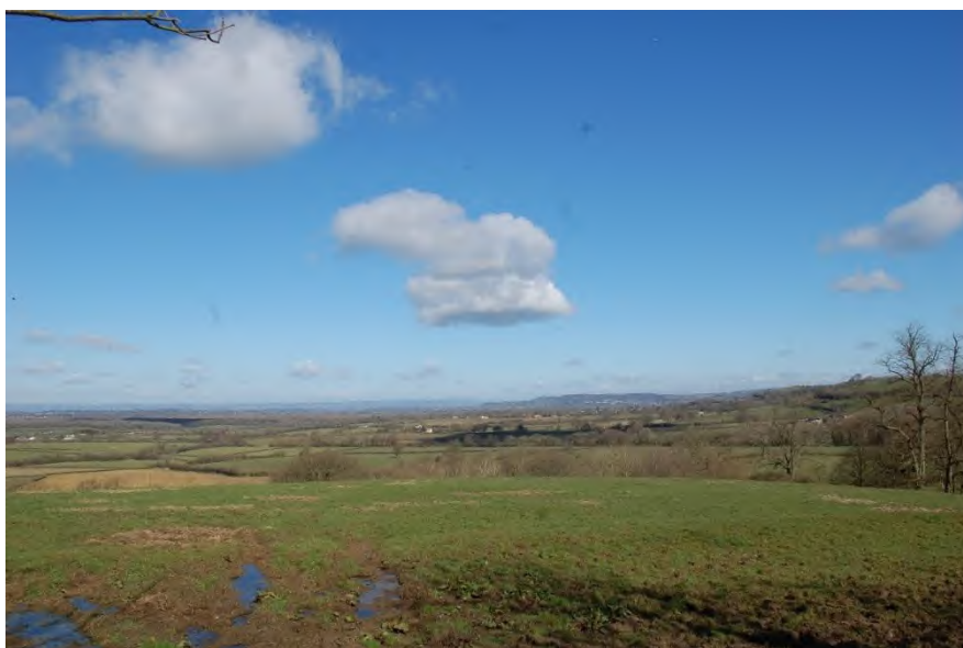
Figures 1. Top, Woodland to East of settlement Figure 2. Bottom, Views South of Horton from Horton Road