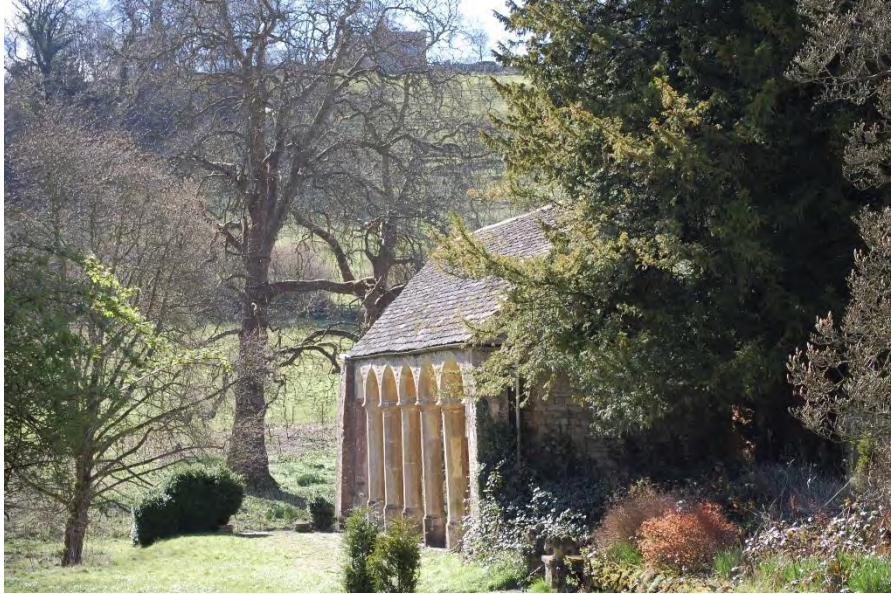
Figure 8. Six bay arcadia loggia

Horton Cottages, lying to the South West of Horton Court also date from the 16 th century and were formerly the farmhouse to the Court (See figure 9). Further afield, there is also evidence of archaeological remains of a lost part of the village, rabbit warrens, deer park, and to the north a large fairly complete set of fishponds which provided the Court with fresh fish.