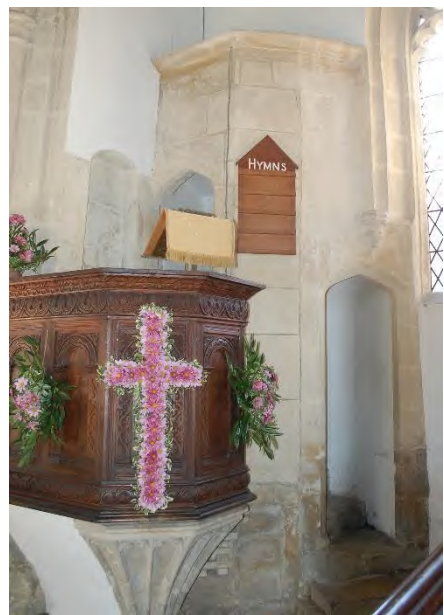
Figure 3. Left, St, James Church Figure 4. Right, Jacobean Pulpit

Adjacent to the Church is Horton Court (see figure 5), a 16 th century Manor House built in 1521 by William Knight, However, the Manor incorporates a far older Norman Hall (see figure 6) which was built c1140 as property of the church.