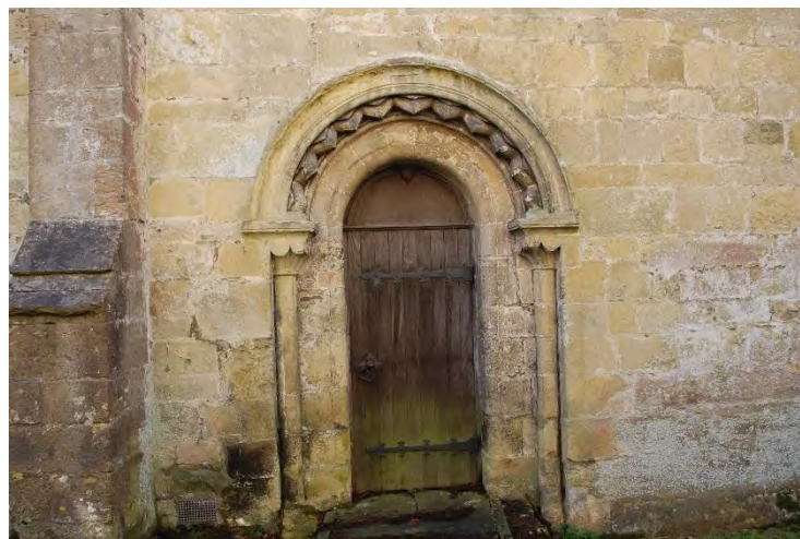
Figure 7. North doorway of the Norman Hall

The Hall is a one storey building, the north and south doorways (See figure 7) being original and the timbered roof of 14 th century origin. In the 18 th century the Hall was divided horizontally into two and the upper floor made into a Roman Catholic Chapel. It was restored to a single room at the end of the 19 th century.