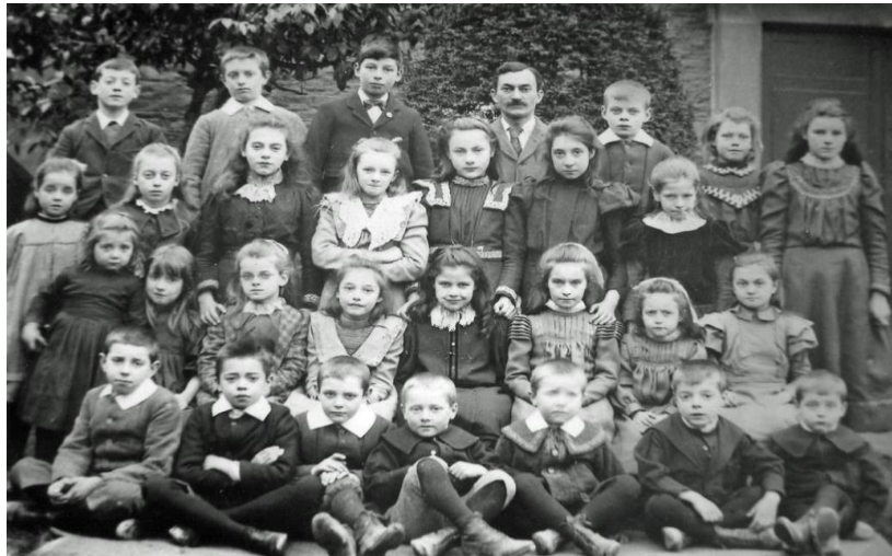
Whiteshill School 1900