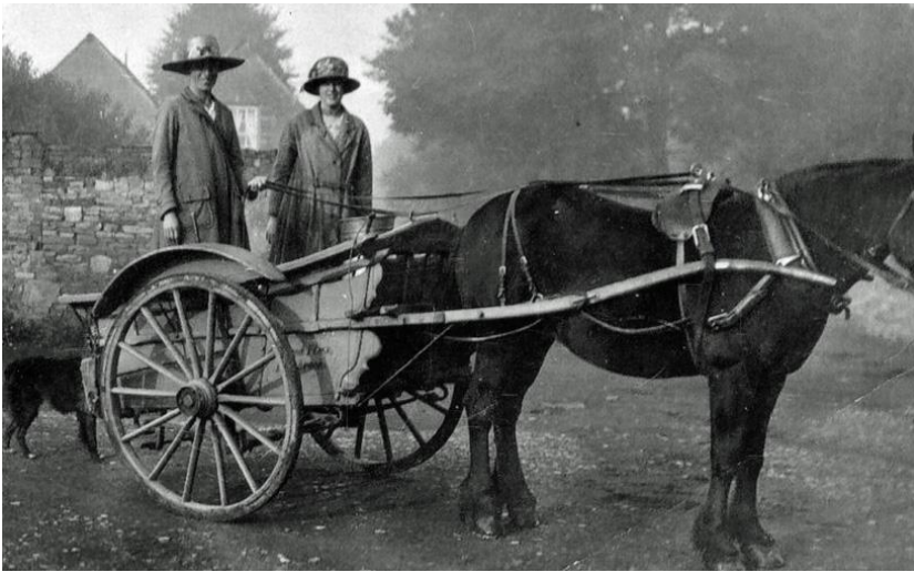
Walton Farm, 1916. Kit and Mabel delivering milk.