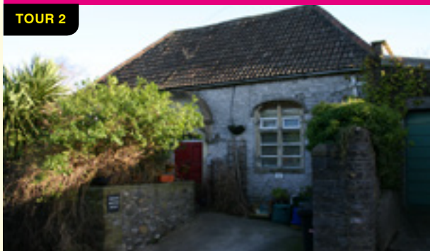
Chipping Sodbury former Friends Meeting House

Start at the east end of High Street, walk west and turn right into Brook Street. Tucked away on the brow of the hill is the former Friends Meeting House [9] now converted into a private dwelling. The shell hood over the door bears the date 1692 and is likely to be the date of this charming building. Is this the earliest surviving nonconformist meeting house in South Gloucestershire?