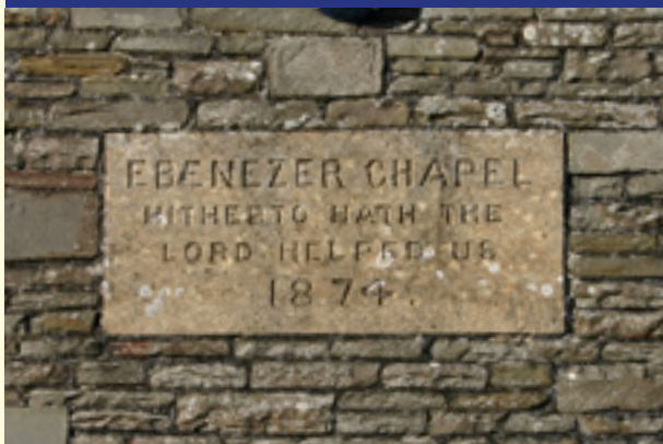
Name stone of the former Ebenezer Chapel, Rangeworthy. The text is 1 Samuel 7.12

Check times and stopping places of buses when planning your route – contact telephone numbers and web addresses are given on the back fold-out.