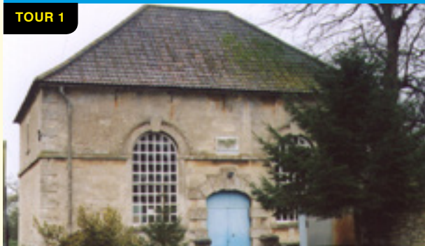
The former Unitarian Chapel, Marshfield (the Old Meeting)