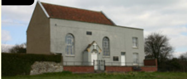
Ebenezer, former Bridgegate Methodist Church

Two relatively long walks are suggested to give a flavour of the area and its chapels – one around Warmley and the second around Winterbourne. Start at Bridgegate Common with Ebenezer [3] , originally built for the Wesleyan Methodists in 1810 and purchased by the United Free Methodists in 1855. Now converted to a holiday let. A walk down Bath Road, bearing right into Poplar Road and right again into Mill Lane brings you to Mill Lane Independent Methodist Church [55] established here in 1899 by a breakaway temperance group. At the top of the rise is the former Wesleyan Chapel [57] of 1833 now converted into housing. A little further north in Tower Road is another Ebenezer [56] until recently Warmley Tower United Church, a grand Italianate church built for the Free Methodists in 1868. Along past the brass works of the Quaker William Champion and to the end of Tower Road and bearing right across into Chapel Road brings you to Warmley Congregational Church [54] built in 1846. The London Road takes you over the railway and past the site of Crown Colliery back to the start.