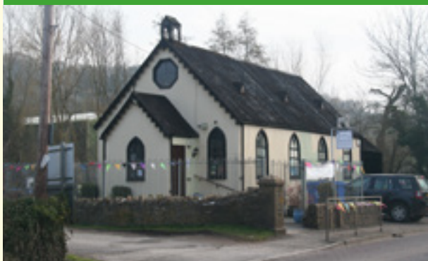
Former Swineford Congregational Church

The idea of the Tabernacle, in Biblical terms a moveable structure, an 'itinerant temple' in which to keep the tablets of the Law, was a powerful one. Whitefield was concerned that the Kingswood Tabernacle be 'not too large or not too handsome lest we need to move our tents'. Some churches deliberately built their chapels of temporary materials, particularly either of timber or later of timber and corrugated iron. Should a more permanent structure be required then the tabernacle could be moved to an entirely new site to further a new mission.