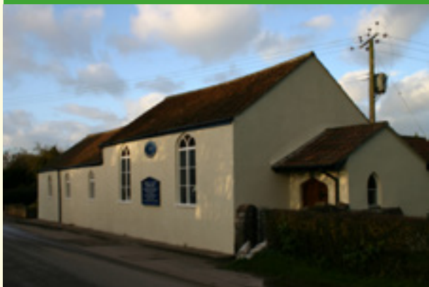
Oldbury-on-Severn former Methodist Church

Rejoin cycle route 410 to cross the northern tip of the South Gloucestershire and North Somerset Coalfield. Follow the route through Cromhall to Townwell and Cromhall Chapel [12] . This is an example of a simple early 19th century Independent chapel with chapel and minister's house under one roof-line and set in its own burial ground.