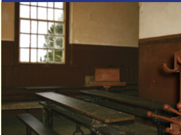
The interior of the school room

The roofline extends back to include a school room on the ground floor and a lodging room above.