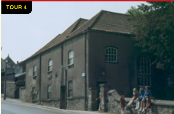
Whitfield Tabernacle in the 1980s

A relatively short walk along Regent Street and Two Mile Hill encompasses the history of the Awakening after the breach between Whitefield and Wesley. Start in Park Road.