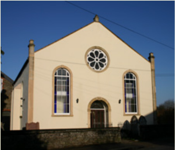
Hanham United Reformed Church (Hanham Tabernacle)

Several towns and villages such as Marshfield have their own heritage trails. Books on our nonconformist heritage can be obtained through public libraries, museums and bookshops. You can visit the council's website at www.southglos.gov.uk/heritagetrails