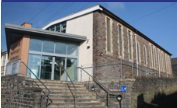
Hanham Baptist Church (1907, rebuilt 1959, next to the site of the 1714 meeting house. The porch is a recent addition)

We hope that you have enjoyed the trail and have found something of the spirit of the early nonconformists in the buildings they commissioned and the churches they founded.