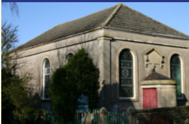
Upton Cheyney United Reformed Church

Upton Cheyney United Reformed Church [53] was built in 1834 for an Independent congregation that had been meeting locally for some years, originally inspired by the preaching of John Cennick. Its exterior is designed in a restrained Classical style in dressed Bath stone with an ogival roofed porch and offset door, so necessary on this exposed hillside. An extra leaf has been added to the door to allow room to swing coffins into the church.