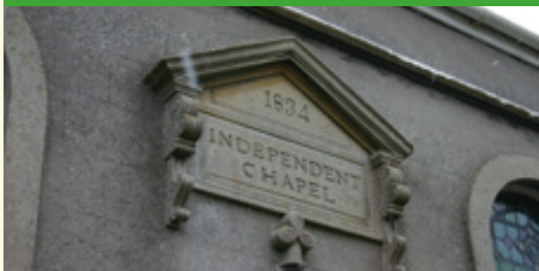
Name stone of Upton Cheyney United Reformed Church

A choice of 7 themed tours is offered covering some 37 locations. They are designed to be enjoyed either in sequence or to stand alone. There are frequent bus services to places from which you can comfortably walk six of the tours. One tour is more extended and demands the use of a bicycle or car. In addition there are a further 9 sites key to the themes of the trail.