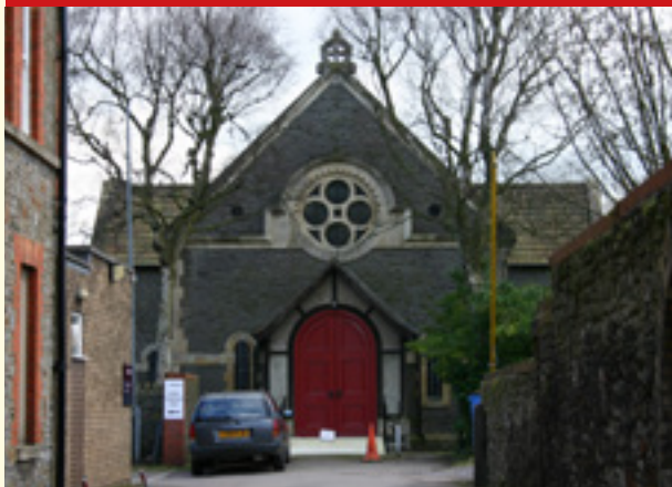
United Church, formerly the Moravian Church, Kingswood