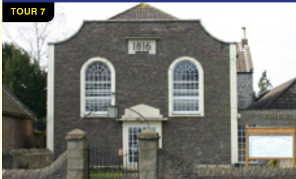
Whiteshill Evangelical Church, formerly White's Hill Congregational Church 1816

Coalpit Heath was one of the areas of primitive coal mining and further down the lane was the complex of Frog Lane Colliery, the last traditional deep pit to work the coalfield. Our trail takes the higher ground to the west starting just opposite the windmill in Frampton Cotterell at Zion United Church [16] , a Gothic structure in the Decorated style built for the Congregationalists in 1873. From here follow Woodend Road down to its junction with Park Lane and bear left across to Harris Barton and follow the footpath across Nightingale's Bridge up to and turn left into Watley's End Road. Here is Ebenezer [58] , a former United Methodist Church of 1868 built to rival Salem nearby at the other end of the turning next left, Factory Road (named after a hat factory which once worked here). The foundation stone of Salem Methodist Church [59] was laid by John Wesley himself in 1787.