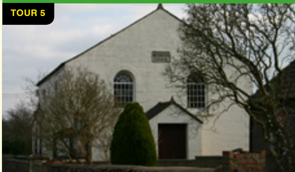
Bethesda, Hawkesbury Upton

This trail follows parts of national cycle routes 410 and 41. It crosses South Gloucestershire from east to west and is mostly downhill. Both routes are clearly way-marked. The trail takes you to a number of chapels that are typical of this area in their scale and style.