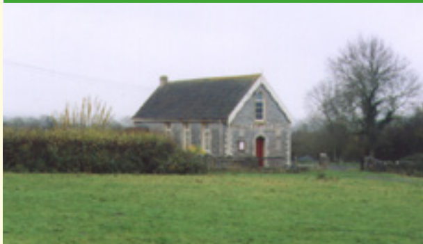
Tyndale Baptist Chapel, Little Sodbury End