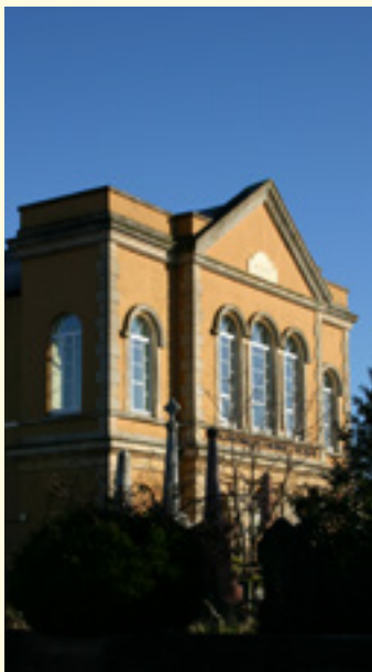
Kingswood Methodist Church

Walk west along Regent Street and turn left into Blackhorse Road.