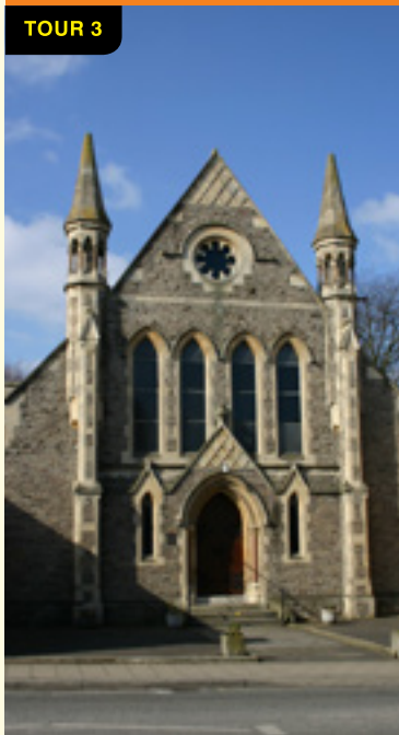
Thornbury Methodist Church

Start in the High Street at the Methodist Church [49] . This is a good example of the spikey Gothic revival style of architecture for a late 19th-century church. The present building replaced Wesley Chapel [48] (turn south down High Street and left into Chapel Street to what is now Cossham Hall). This was built in 1789. John Wesley himself preached here in 1789 and 1790. The chapel was extended in 1835 but eventually still proved to be too small. In 1888 Handel Cossham purchased the building and presented it to the town for community use.