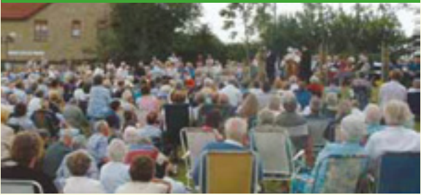
Gathering on Hanham Mount on 23rd June 2003 to mark the tercentenary of John Wesley's birth

The wild remote wastes of Kingswood Forest had attracted open air meetings of persecuted nonconformists from early days. Scattered squatter settlements had grown up over much of the area between Cromhall, Bitton and Bristol, particularly as the demand for coal grew from the 16th century and with them a thin scatter of meeting houses of the Old Dissent. By the 1730s the Church of England was organisationally unable to do anything to serve the growing population (it was not until 1756 that the new parish of St George was established and 1820-50 before resources could be created for churches at Kingswood, Fishponds, Frenchay, Hanham and Two Mile Hill).