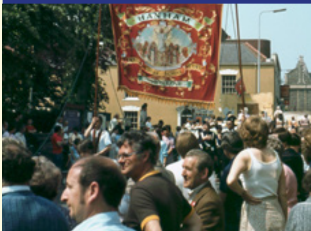
Banners high on the former Whit walk in Kingswood

From the very beginning chapels and meeting houses were the focal point of the social lives of their communities, not solely places of worship. Any chapel has numerous regular meetings and many share their facilities with the wider community.