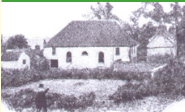
The Colliers' School and Chapel before remodelling in 1895