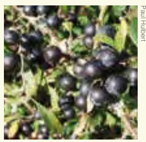
△ The Blackthorn's common name comes from its dark bark. The bitter sloe fruits are an important food plant for

Local Nature Reserves are natural sites that have a legal status. Reserves help to protect wildlife habitats near towns, making an important contribution to the UK's biodiversity. Bickley Wood is an SSSI (Site of Specfic Scientific Interest) because of its important geology. Look out for these common plants at Avon Valley Woodlands: