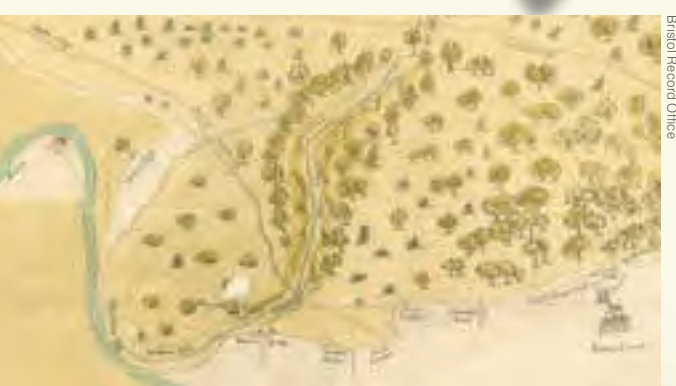
△ This map is dated 1610. It shows few signs of the

Once part of the old Kingswood Forest, most of the site is oak woodland. Some semiimproved grassland can be found at the top of the slope and there are small areas of floodplain meadow, hedgerows and scrub along the riverbank. Some small areas of ash, wild cherry and sycamore have developed in the old quarries and on some of the grassland and scrub areas.