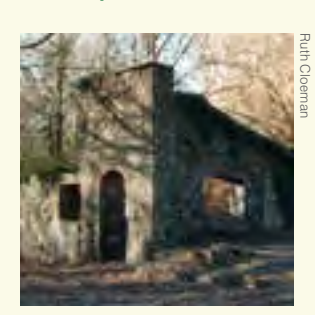
near the 100 steps housed a copper smelter that was advanced for its time.

The black triangularshaped coping stones on the walls on Ferry Lane. These were cast from copper slag - a byproduct of brass and an example of waste material cleverly re-used.