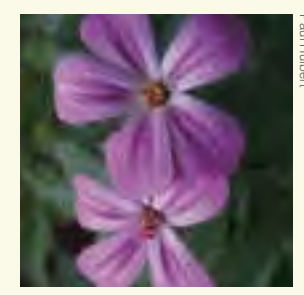
The familiar sight of the abundant Herb Robert a member of the geranium family and one of many common wild flower species.