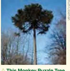
△ This Monkey Puzzle Tree is one of two that marked the entrance to Conham Hall, nr. Conham River Park.

The black triangularshaped coping stones on the walls on Ferry Lane. These were cast from copper slag - a byproduct of brass and an example of waste material cleverly re-used.