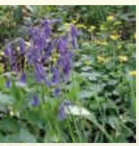
Wildflowers such as bluebells, celandines and wood anemones. These are flourishing as dense woodland is opened up to let more light reach the