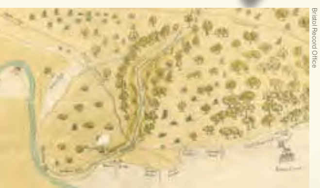
intense industrial activity that was to take place here in the following centuries.