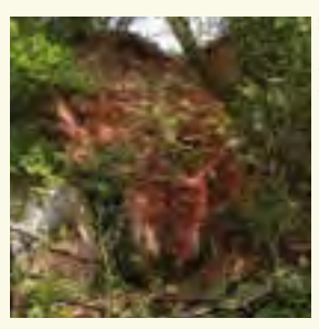
△ The red Pennant sandstone on the quarried slopes of Bickley Wood