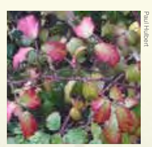
△ Bramble can be found throughout the woodland. If managed, it forms part of a scrub layer that protects wildlife and birds