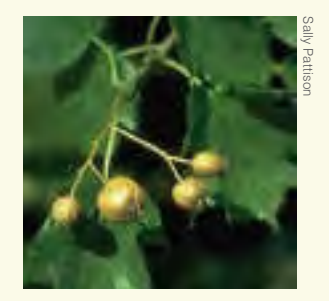
△ The berries of the 'wild | service' trees in Hencliff Wood, commonly known as 'chequers'.