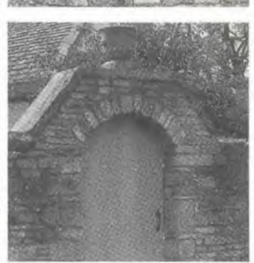
It is important that these interesting features are carefully looked after.