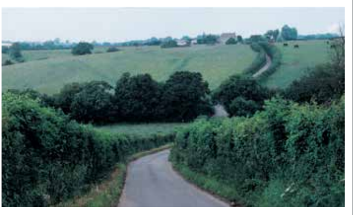
5 View north along Oldbury Lane above the valley.

3 Looking east, with the Golden Valley rising to the Hanging Hill ridgeline within the Ashwicke Ridge character area. The hillside includes Upton Cheyney to the right and Beach to the left.