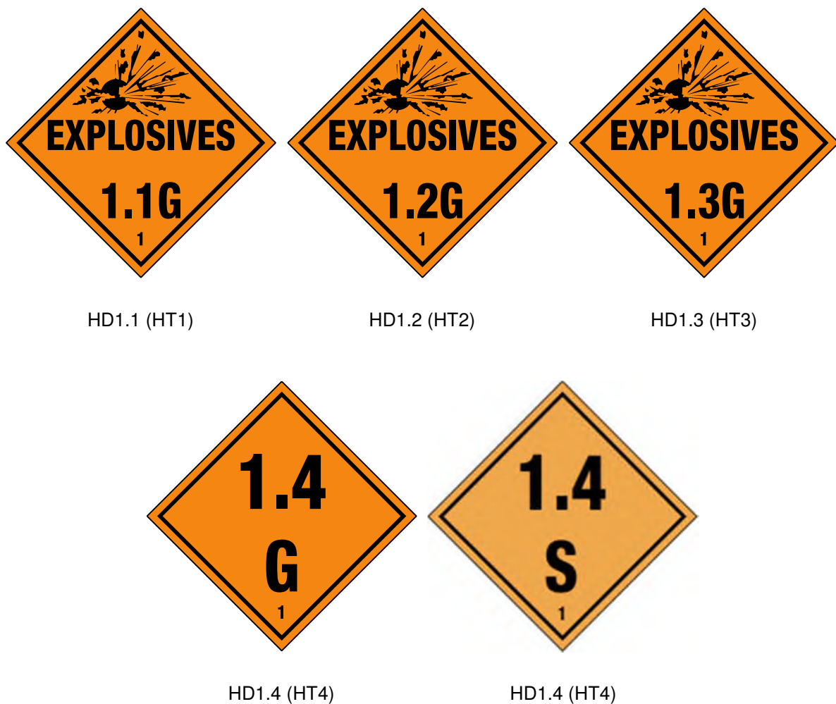
Figure 1 - transport classification labels

1 The cartons used as transport packaging for fireworks will be labelled with an orange diamond similar to those shown in figure 1. The orange diamonds identify the hazard division (HD) that the fireworks have been classified in for transport. The hazard division can then be used to determine the indicative hazard type (HT) for storage.