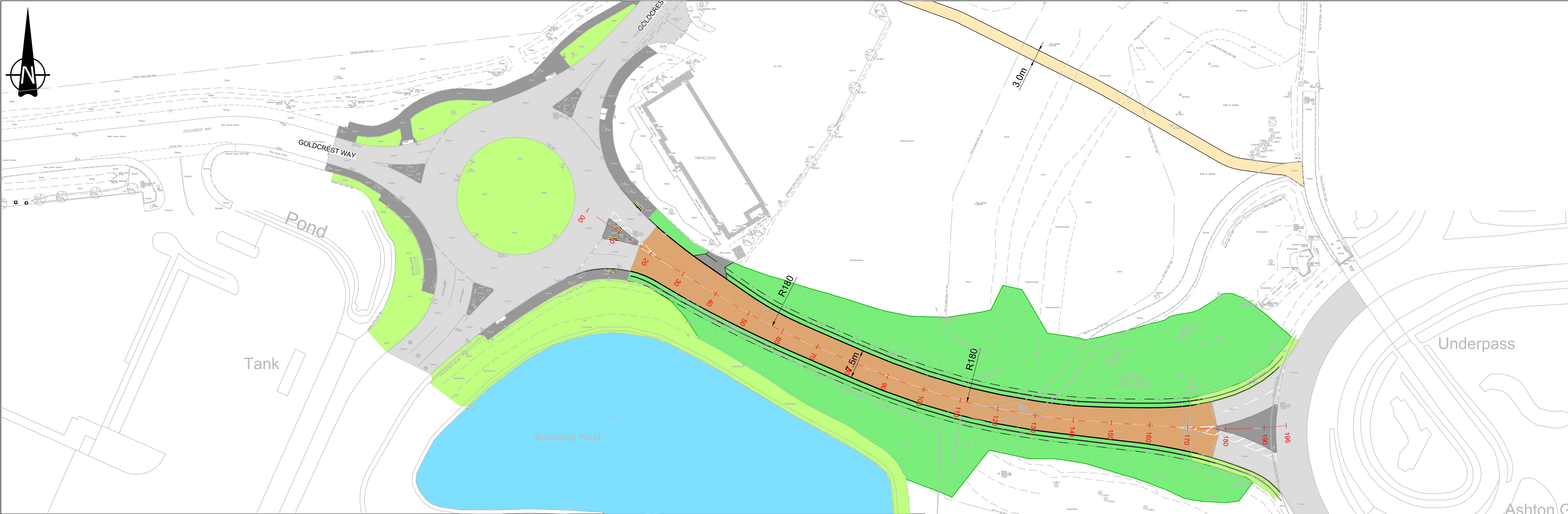
LINK ROAD - LONGSECTION SCALE: H 1:500, V 1:100. DATUM: 5.000