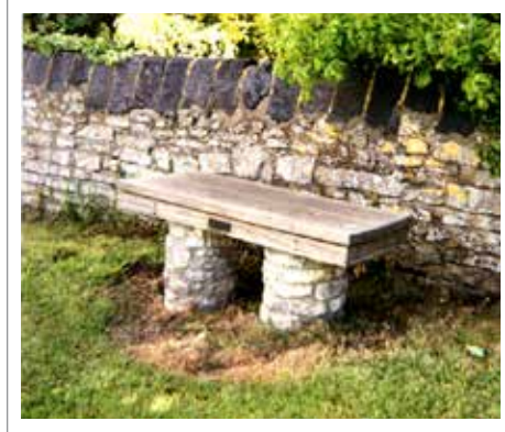
8 Wall of Abson Church, black copper slag coping stones from Warmley Brass Works.