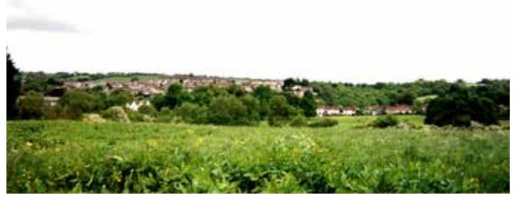
15 Residential development within Wick, with the line of the properties to the right following the A420.