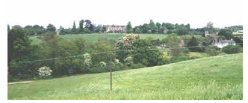
10 Siston Court sits on the ridgeline, with the church and hamlet set within the Siston Brook Valley below.