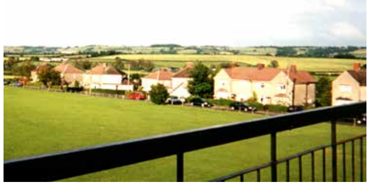
Centre in Pucklechurch, recreation field in the foreground. Shows the dominance of escarpment in the landscape.