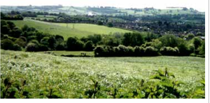
11 Village of Wick with the Cotswold Scarp and Ashwicke Ridges forming the skyline.