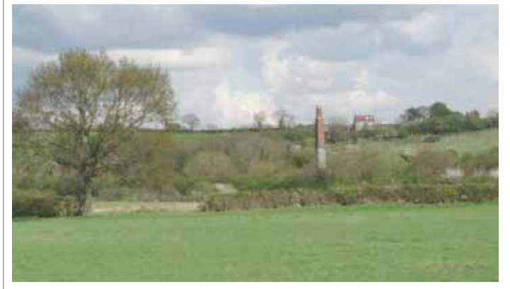
4 View eastwards to the Pucklechurch Ridge, with the chimney 5 Cotswold Scarp. Looking east from balcony of Community of Brandy Bottom Colliery within the middle distance.