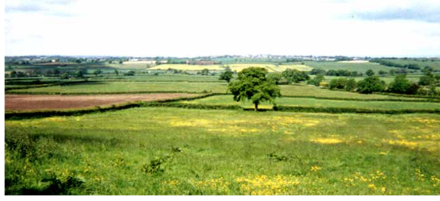
9 Looking West from the Cotswold Way across the broad Boyd Vale, towards Pucklechurch and its trading estate.