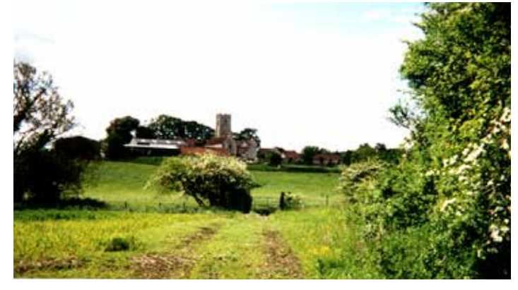
6 Boyd Vale towards Cotswold Scarp from near Talbot Farm, 7 Abson. Church of St. James and village. Also a key skyline feature in views from Doynton.