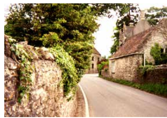
13 Doynton village. Stone walls and buildings contain the lanes.