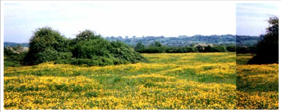
1 Kingrove Common with the Cotswold Escarpment at Old Sodbury in the background. Used by most of the local farmers for grazing. Horses have been banned to deter travellers.