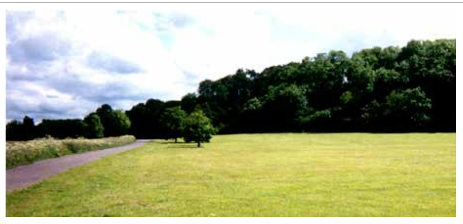
2 Wapley Bushes and Wapley Common.