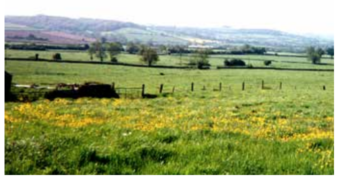
at the top of Burchall's Hill. Dyrham Woods (LCA4) nestle in the fold of the scarp.