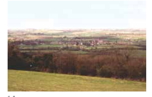
14 View from Toghill picnic area, with Doynton village in hollow, Pucklechurch on the low ridgeline behind with the trading estate evident. Bristol lies to the left in the distance.