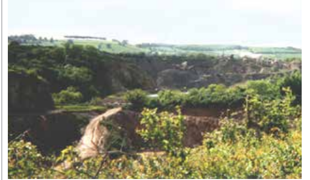
12 Wick Quarry within wooded framework. The works buildings however remain visible beyond the site.