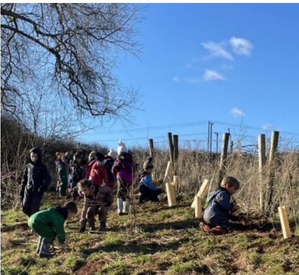
Community bulb planting on Siston Common.