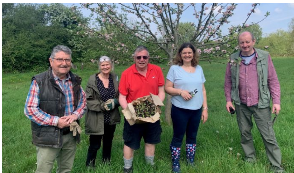
Friends of Wapley Bushes volunteers undertaking orchard maintenance.