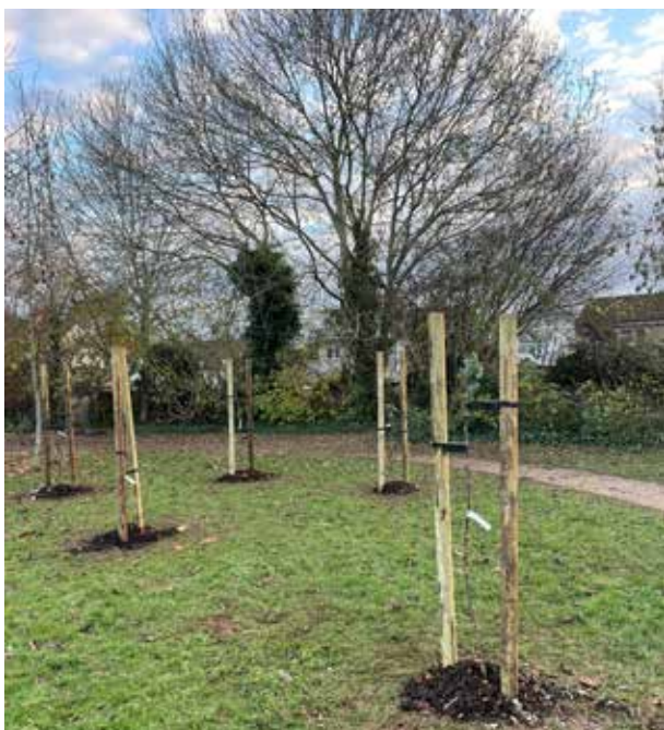
Orchard planted at Cadbury Heath Primary School.