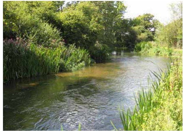
The Bristol Frome river.

A partnership project across the Bristol Frome River catchment to reduce flood risk, improve soil health, create wildlife habitats, and enhance water quality.