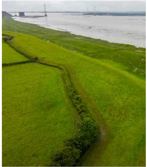
View over the Severn Estuary from Whale Wharf, Littleton on Severn.