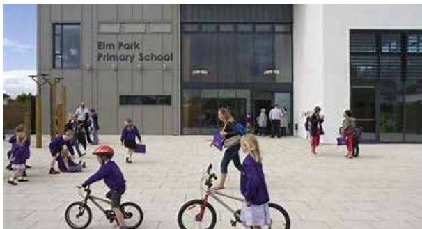
Elm Park School built to 'Passivhaus' energy efficiency standard.

We have built several new highly energy efficient (Passivhaus) schools in South Gloucestershire including Frenchay Church of England Primary School, and Elm Park Primary Winterbourne. We are currently building the largest Passivhaus school in the country in Lyde Green.