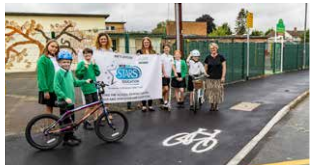
Ridge Junior School celebrates their Modeshift STARS award.

South Gloucestershire is now top of the league table for large councils, with the highest percentage of schools with accreditation overall for the Modeshift Stars Programme. We have 29.5% of schools accredited – 3 Approved, 18 Good, 9 Very Good, 3 Excellent, 3 Outstanding.