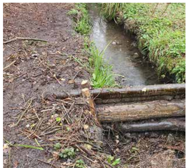
A 'leaky dam' to slow the flow on Stoke Brook to help reduce flood risk on the main Bristol Frome river.