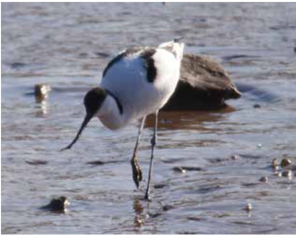
Avocet wading bird.

The council and our partners are working with local communities and landowners to improve habitat for nature and flood and drought resilience across the Lower Severn Vale, Levels and Shore of South Gloucestershire.