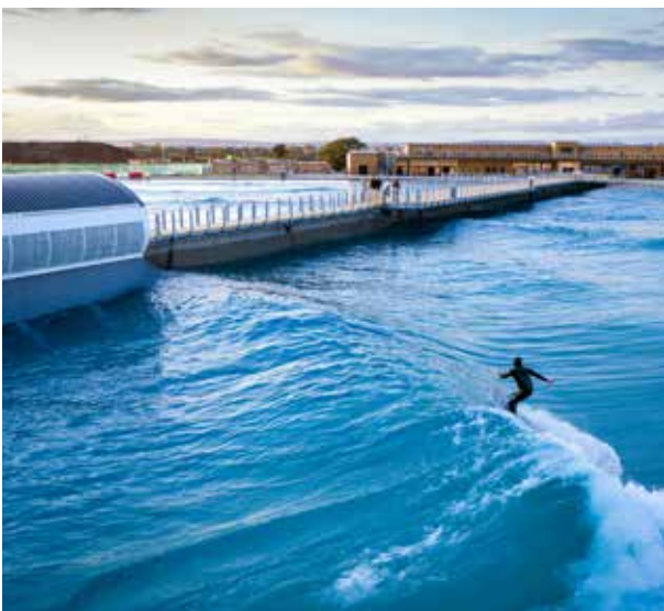
The Wave Drone 4.

179 solar system installations and 167 batteries have been installed for residents through our regional Solar Together scheme and round 3 is currently underway. The Council has supported the installation of solar panels to help power the Wave inland