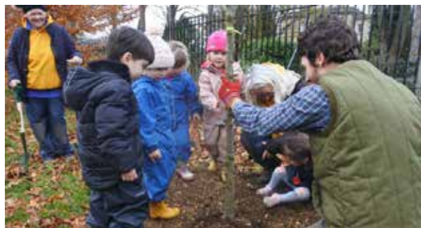
Children from Page Park Preschool tree planting in Page Park.

Thanks to funding from a range of sources we are planting trees across our area to increase tree canopy cover, improve biodiversity, provide natural cooling, shading, and flood resilience, to create greener and more resilient communities where people and nature can thrive.