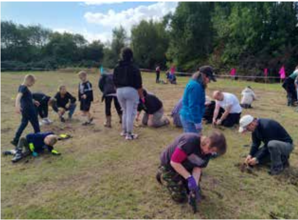
Wick Primary students planting a hedgerow at Brockwell Park.

A project working to restore and connect habitat for nature and engage communities in the east Bristol fringe area of South Gloucestershire