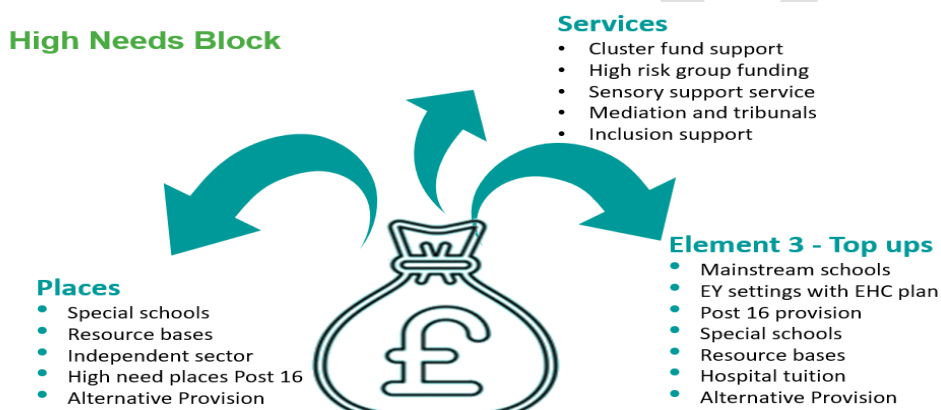
Figure 2 shows the totality of the High Needs Funding Block

The High Needs Block provides resources to pay for inclusion support services, specialist places and top-up funding. Decisions about spend in one area has a knock-on effect on resources available in other two areas. Partners in local areas should work together to ensure that there is a strategic agreement on the appropriate balance between spend on service, places and top-ups.