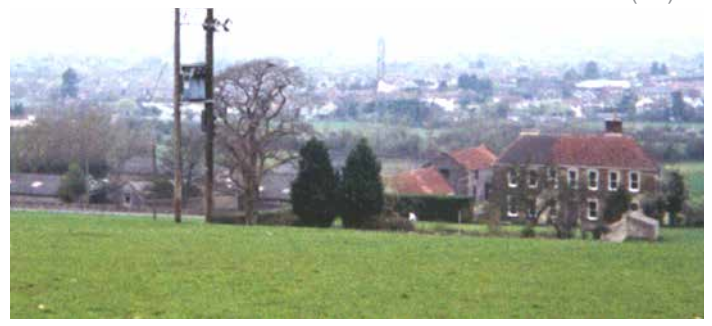
12 View from the Oldland Ridge, north west to the varied urban fringe of Oldland Common with Kingswood and Bristol beyond.