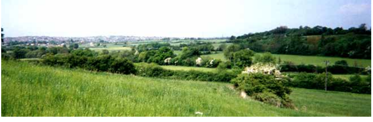
8 Siston Brook Valley looking west to the urban edge of Kingswood from Tut's Wood Hill.