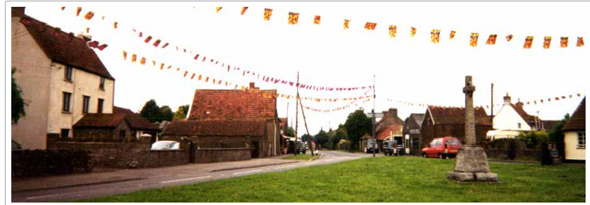
1 Westerleigh with its village green. The focus of three roads, lined by older residential properties...