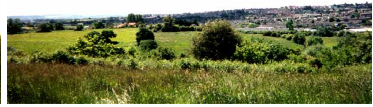
6 Panoramic view of Kingswood from Rodway Common.