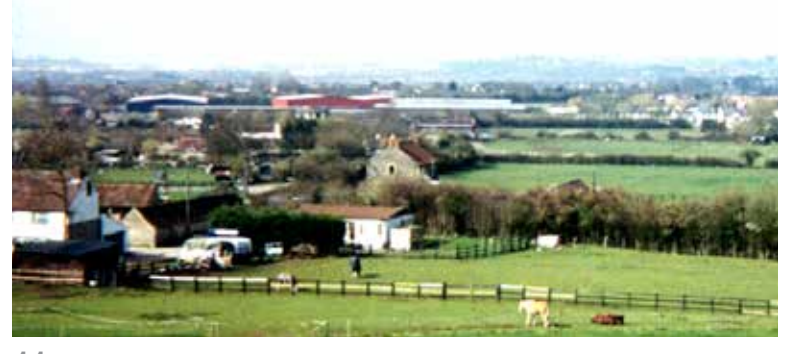
11 Fringe area on boundary with North Common. Farm and horsiculture development meet new light industry. Paddocks and stables are common. Kingswood and Bristol define the skyline.