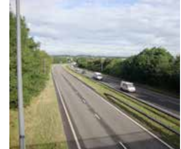
13 View from the cycle path bridge over the Avon Ring Road showing the mature planting that provides a robust and effective screen and buffer to adjacent development.

Figure 38 - Area 12 Westerleigh Vale and Oldland Ridge