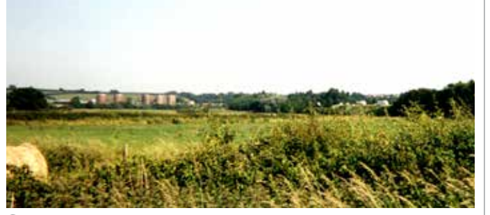
3 View from Lyde Green with the Oil Terminal and M4 visually prominent.