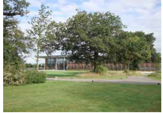
4 Emerson's and Lyde's Green are areas of significant change. These views in the Science Park show how existing trees and hedgerows along with new open spaces and planting provide a robust landscape setting within the new development.