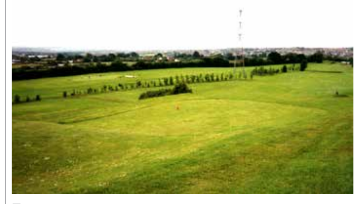
7 Shortwood Lodge Golf Course and powerlines, with the urban area of Kingswood forming the western skyline.