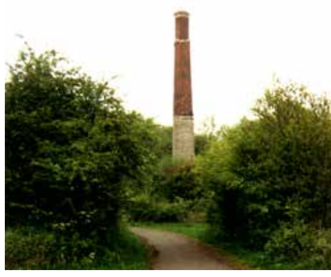
5 Brick chimney remaining from South Parkfield Colliery on the Shortwood spur of the Bristol and Bath Railway Path.