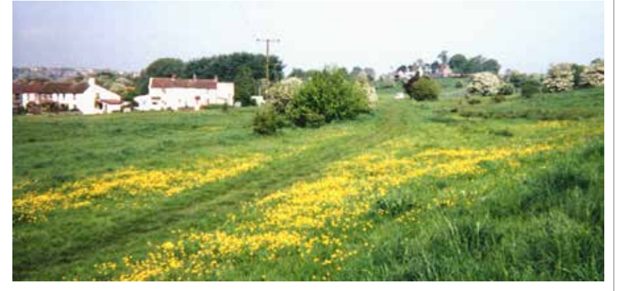
9 The Dramway crossing Siston Common. Rural characteristics are overshadowed by the Kingswood urban edge. The Ring Road lies in cutting to the west (left).