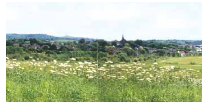
10 View from Warmley Forest Park "Millennium Seat" looking southeast to Warmley Church spire and distant skyline of the Cotswold Scarp.