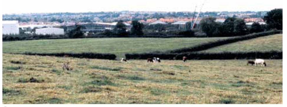
2 Looking south, with the large commercial sheds of Emerald Park and red roofs of Emersons Green. Bristol extends along the skyline with the M5 Motorway hidden by the foreground landform.