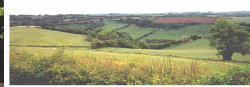
3 Side valley of the St Catherine's Brook Valley. Valley sides and bottom grazed and top cultivated. Westbury White Horse can be seen in the distance on a clear day.