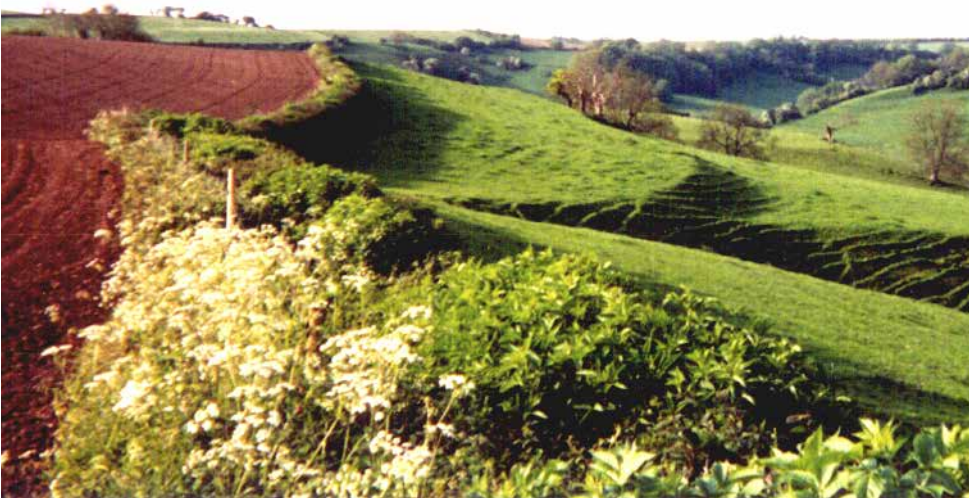
7 St Catherine's valley looking towards Marshfield and beyond Cold Ashton Parish. Valley bottom and sides grazed, tops cultivated.