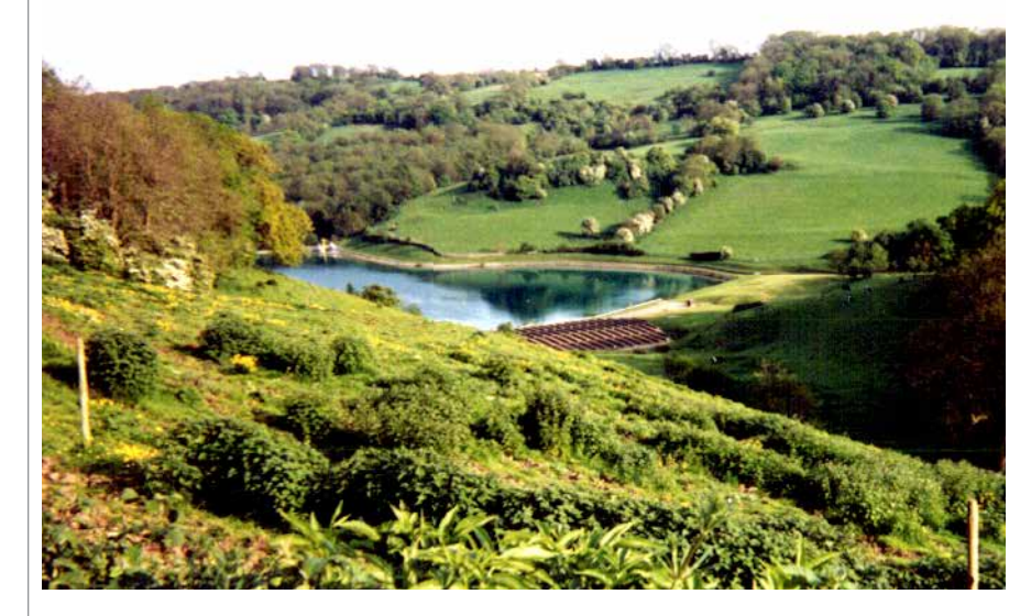
6 Monkswood Reservoir, within the St Catherine's Brook Valley.