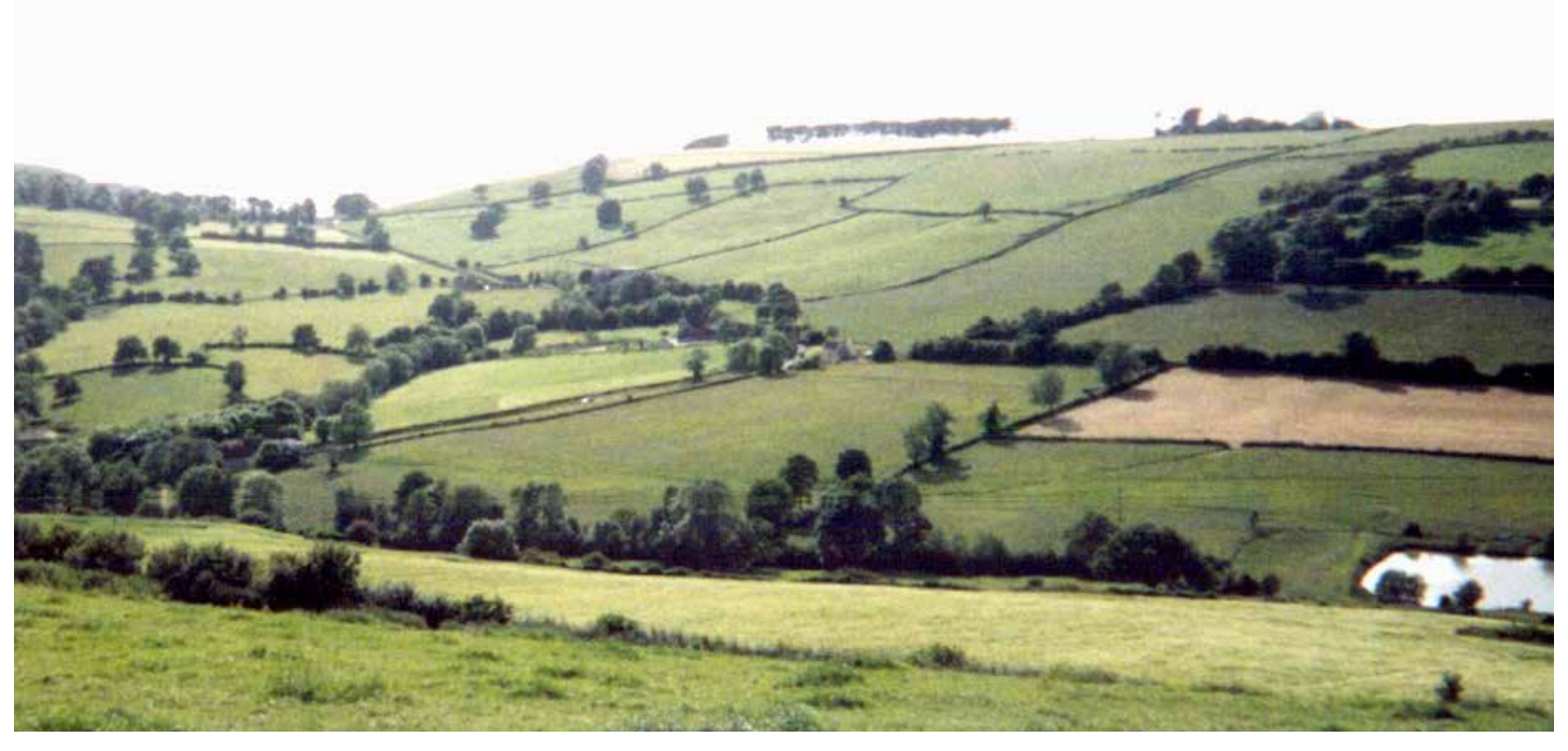
5 The Hamswell Valley, site of the Battle of Lansdown with beech trees on the skyline at Freezing Hill, in the foreground an amenity man-made fishing lake. The Cotswold Way runs through the valley.