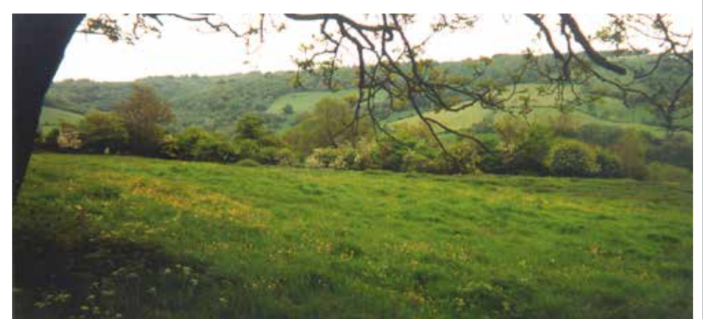
8 Extensive woodland from near the Three Shire Stones on the south east boundary of the area.