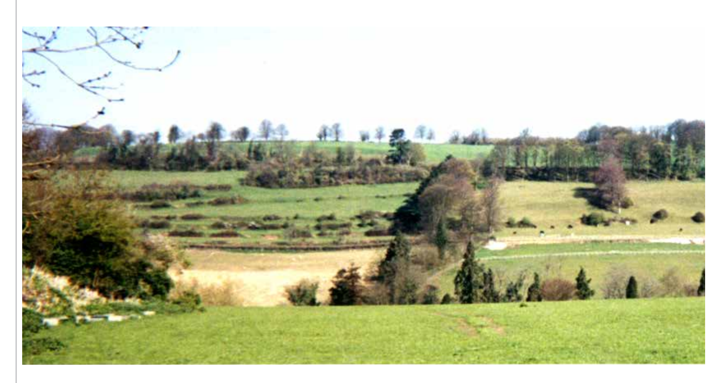
4 Pipley Bottom valley with terraced fields. Ornamental trees were introduced by Canon Ellacombe of Bitton Church.