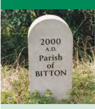
Bitton Parish Boundary Marker