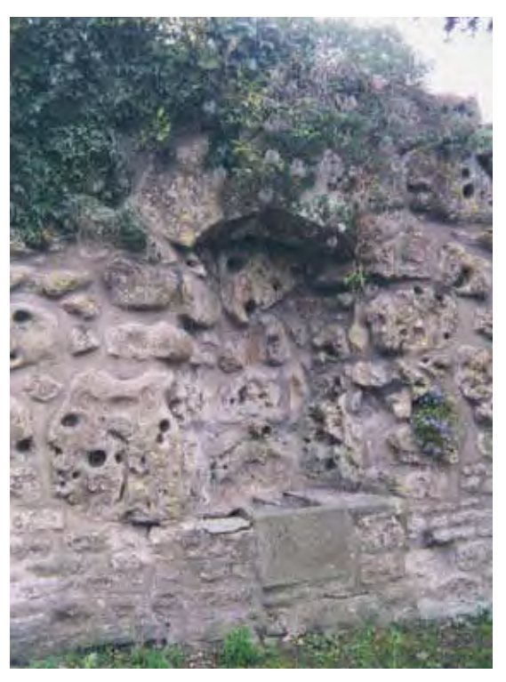
Fountain near green, Tockington

The Government also stresses the need for good design which respects local distinctiveness in Planning Policy Statement 1: Delivering Sustainable Development, including reusing and incorporating existing buildings which contribute to local distinctiveness and character of an area.