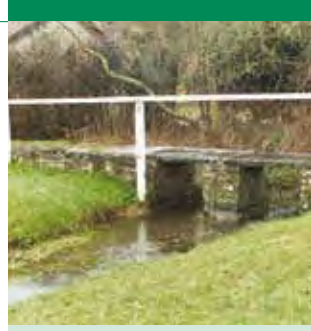
Stone footbridge -Station Road, Yate

Owners may challenge listing by demonstrating that their building or structure does not meet any of the 10 Criteria above.