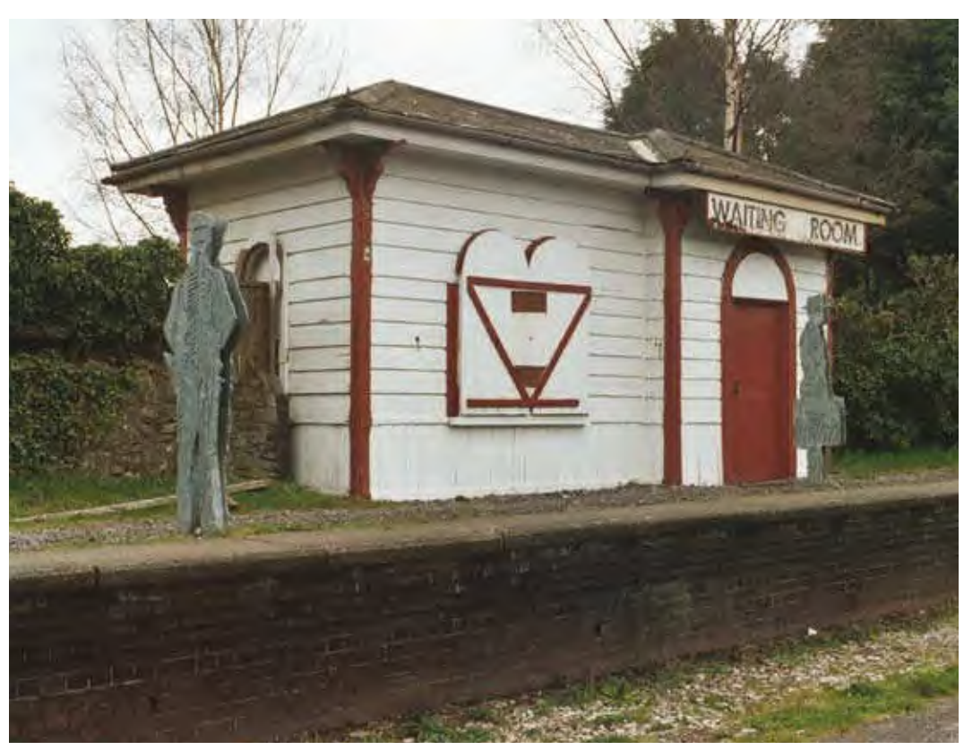
Waiting Room on the Bristol to Bath Cycle Path at Warmley

When considering proposals for development affecting buildings on the Local List, the Council will assess the proposed development using the following guidance. Where the council has no control over the alteration, extension or demolition of a building on the Local List it is hoped that this guidance will serve as a best practice guide for owners and occupiers.