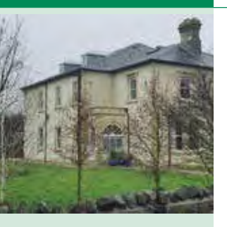
Queens Lodge - New Passage

The inclusion of a building on the Local List does not affect the planning rights relating to the building, and permitted development rights remain unchanged. However, where an application is submitted to the Council for its alteration, extension or demolition, the special interest of the building will be taken in to consideration and its Local Listing status will be a material consideration when determining the application.